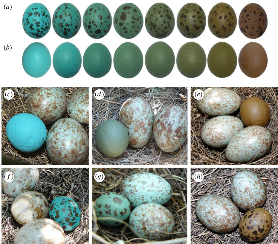
Figure 2. We painted pairs of three-dimensional printed [34] eggs along a phenotypic gradient of blue–green to brown, corresponding with natural variation in avian eggshell coloration across taxa [14], following [17]. After measuring the reflectance spectra of each egg, we (a) painted spots on one set and (b) left the other set unspotted. Here we depict 16 of 70 unique model eggs to demonstrate the range of colours and spotting patterns used. These eggs were placed within chalk-browed mockingbirds' nests (c–h) and the response of the host (either acceptance or rejection) was recorded over a 5-day period.

accept unspotted eggs [21,22]; in addition, spot colour, size, distribution and boundaries all provide valuable information to hosts [23,24]. The optimal acceptance threshold hypothesis predicts that when multiple components of the recognition cue are similar between stimuli (e.g. sharing colour and spotting rather than sharing either colour or spotting), their dissimilarity is decreased, and the likelihood of acceptance is greater [2]. For example, for a host with a spotted egg, the presence of spots on a foreign egg may be sufficient to shift it from the rejection side of the acceptance threshold to the acceptance side of the acceptance threshold, irrespective of that eggshell's coloration (figure 1). Thus, the optimal acceptance threshold hypothesis provides a framework for determining the relative contribution of individual components of multicomponent recognition cues to behavioural decisions.