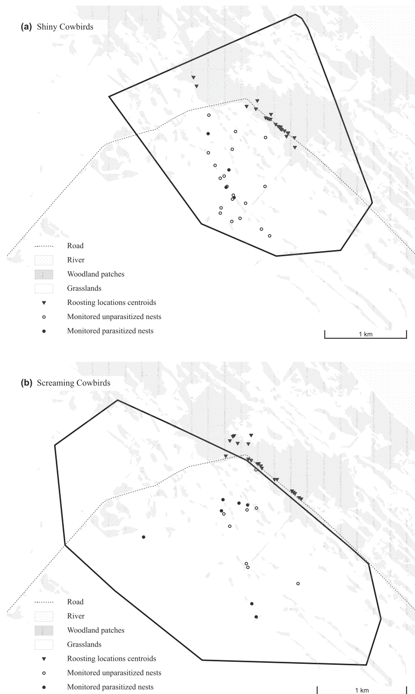
Figure 1. Study area with area used during the day (polygon), roosting location centroids and locations of data-loggers (i.e. monitored host nests) with marked parasitism events for (a) Shiny Cowbirds and (b) Screaming Cowbirds.

individuals caught together in the same trap and showing high levels of association during the day; Scardamaglia & Reboreda 2014). As a control, we