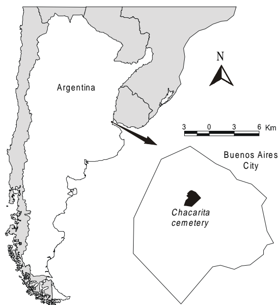
Fig. 1: location of Chacarita cemetery in Buenos Aires City, Argentina

Preliminary study - In September 1998, before the first study period, all containers present in the cemetery were counted. In order to detect areas positive for Ae. aegypti , the monitoring of breeding sites was carried out between October 1998 and May 1999 (mid-spring to mid-autumn). Sampling of containers was made in 40 squares of 50 x 50 m each, which were weekly selected at random from an imaginary grid covering the whole cemetery. The median number of containers examined weekly was 1,166 (first quartile = 1,112, third quartile = 1,239).