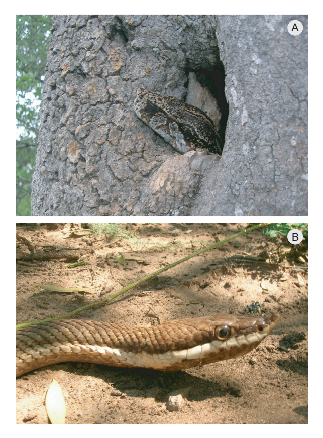
Figure 3. (A) Boa Constrictor Boa constrictor occidentalis visiting an active Blue-fronted Parrot nest cavity. (B) A Baron's Green Racer Philodryas baroni that was removed from a Blue-fronted Parrot nest cavity after partially ingesting a nestling.

one young. The number of surviving nests declined at a higher rate during incubation and the first days after hatching than during the rest of nestling period (Figure 2). Hazard rates were higher during the first days of the nestling stage.