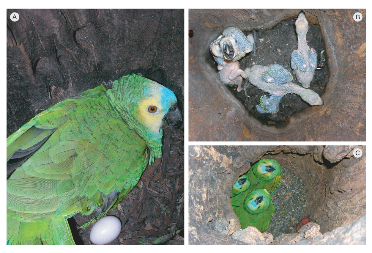
Figure 1. (A) Incubating female Blue-fronted Parrot inside a tree cavity. (B) Brood of four nestlings between 26 and 32 days after hatching and (C) a brood of three nestlings just a few days before leaving the nest. Nestlings fledge on average when they are 58 days old.

We also took the following measurements of the nest entrance hole: height from the ground, minimum and maximum diameter, and inclination. We measured inclination as the angle between an axis perpendicular to the entrance hole area and the vertical line to the ground (see Berkunsky & Reboreda 2009). A value of 90° corresponded to an entrance hole with an axis perpendicular to the vertical plane. Smaller and greater values corresponded to holes that were oriented down or up, respectively. We assigned entrance hole inclination values to one of five categories: -2 = 0°-22°(facing down), -1 = 23°-67°, 0 = 68°-112°, 1 = 113°-157°, and 2 = 158°-180° (facing up).